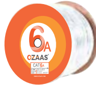
500 meter Roll